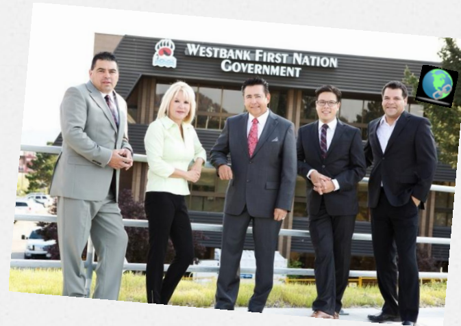
Westbank First Nation Government Story